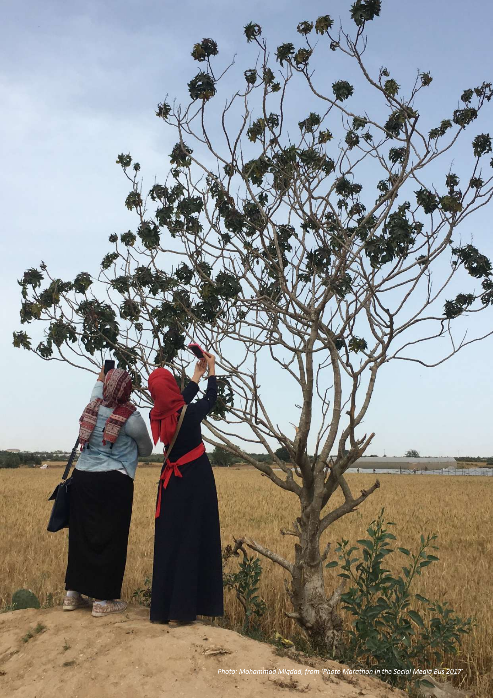
Photo: Mohammad Miqdad, from 'Photo Marathon in the Social Media Bus 2017'